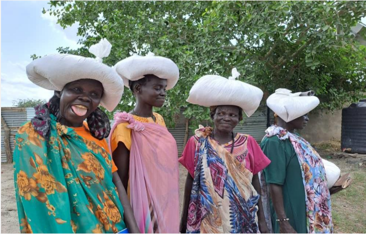
Distributing seeds to women farmer's groups