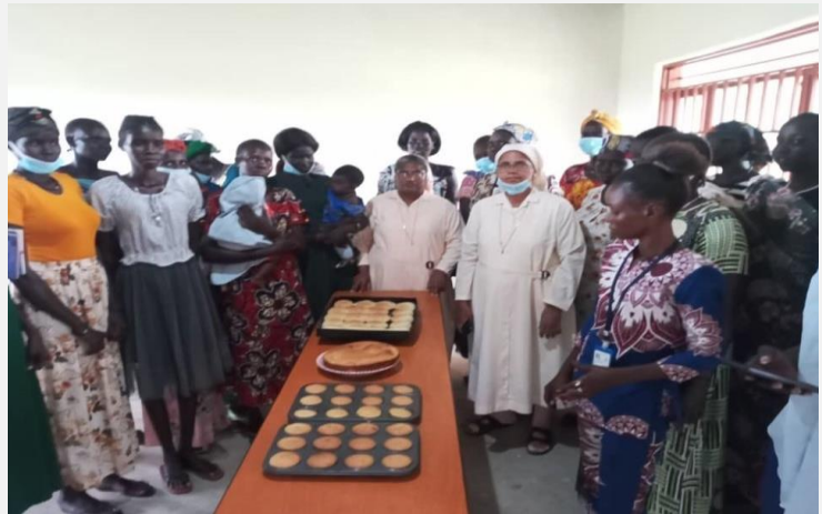
IDP women pose for a picture after confectionery training