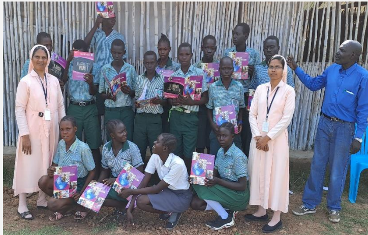
Primary school children receive text books