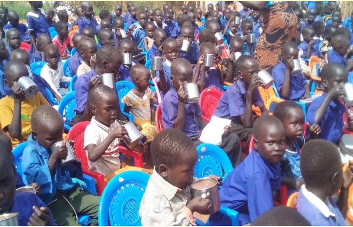
Midday Meal Program