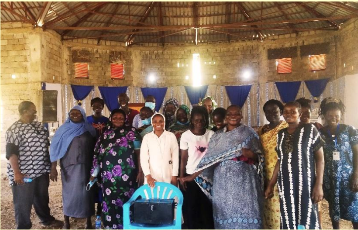
VSLA members have regular meeting and increase their savings