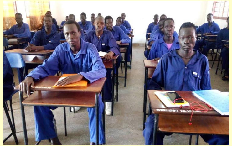
Vocational Training - Unemployed youths get opportunity to learn various skills like Masonry, Electrical and etc.....