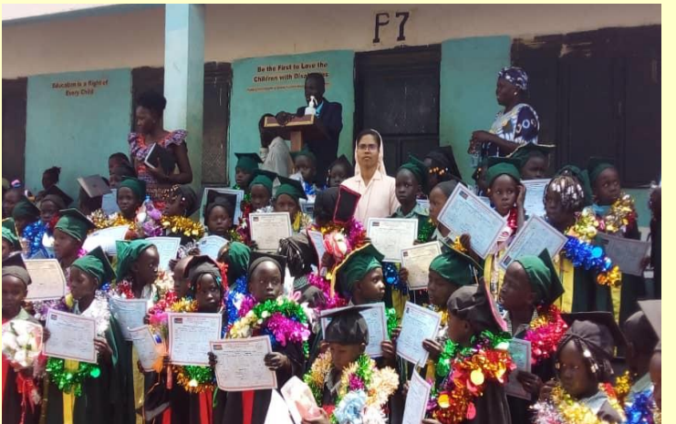
Graduation program for children