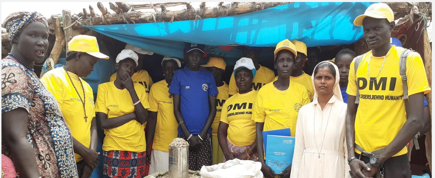
Women engaged in Group Business in Gogrial.