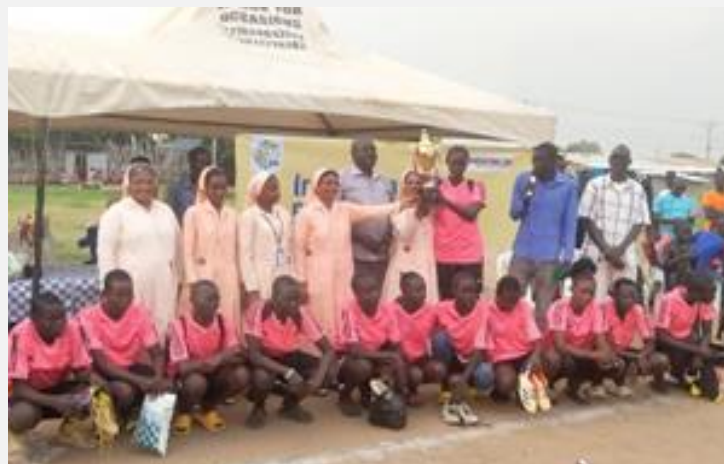
Female Youths after receiving a trophy after winning the volley ball match