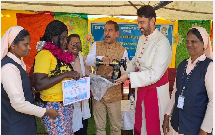
Trainees awarded Certificates of vocational Skills and start-up kits