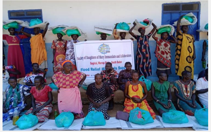
Flood Relief Service in Wau, South Sudan