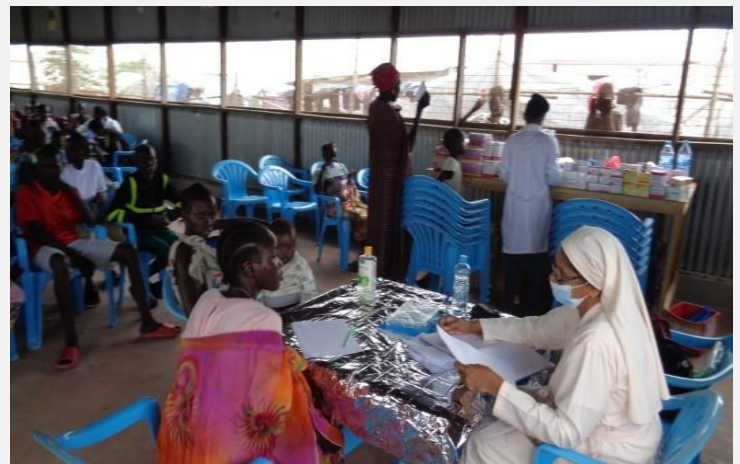
The medical doctor sister, is conducting community outreach clinic