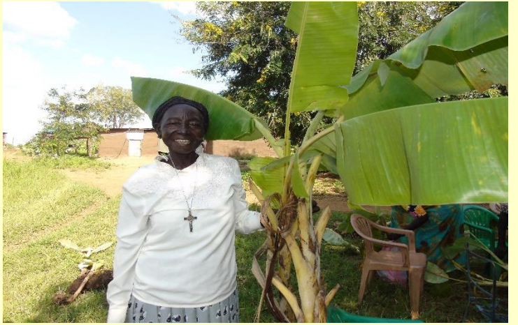
Women Empowerment – Food Security